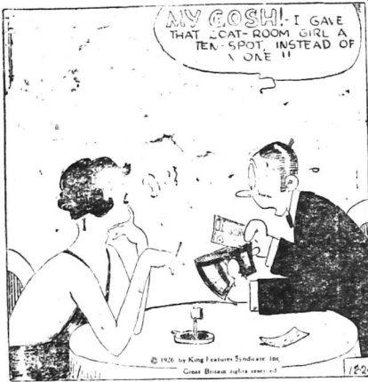
© 1929 by King Features Syndicate Inc. Great Britain rights reserved.